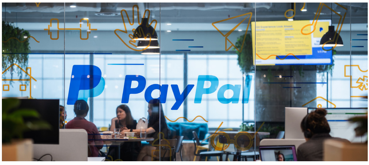
PayPal Singapore office

He added, "Taking 'Collaboration' as an example, we mention 'community' in the Innovation principle, we talk about 'support' in our Wellness principle, and we are ensuring that 'everyone, everywhere' is the backbone of our principles for Inclusion—for me a clear sentiment of 'One Team' collaboration."