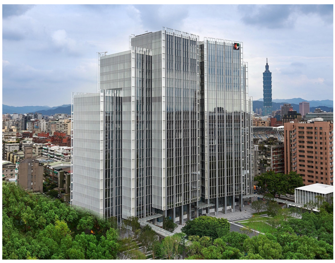
China Development Financial Headquarters

and appreciate what you're talking about—so they can and will replay your story."